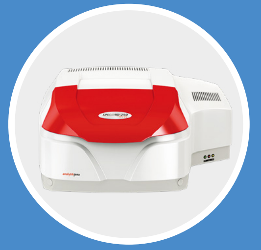
Analytik Jena spectrophotometer for DT Online UV/Vis System