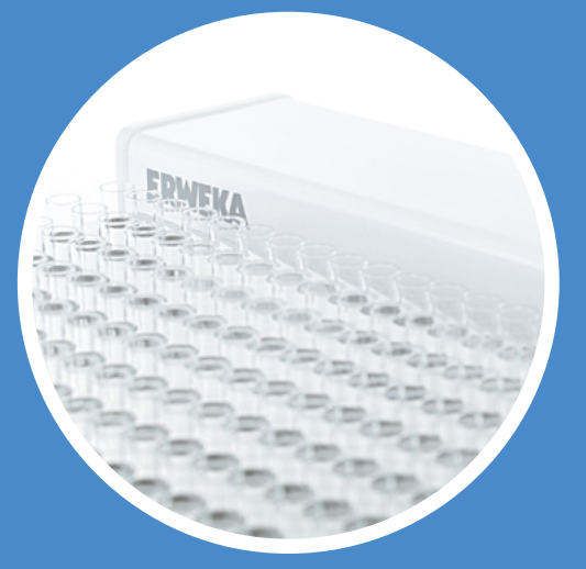
FRL sample sollector for DT Offline System