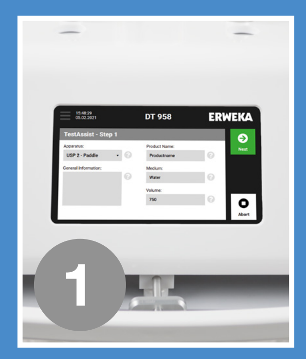
Step 1: Enter method details, such as name, medium and volume of medium.