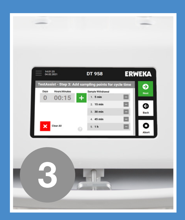
Step 3: Configure cycle times with a simple, yet effective input screen.