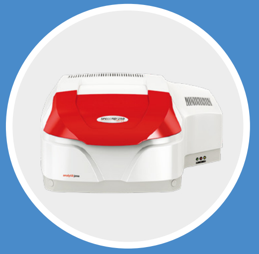
Analytik Jena spectrophotometer for DT Online UV/Vis System