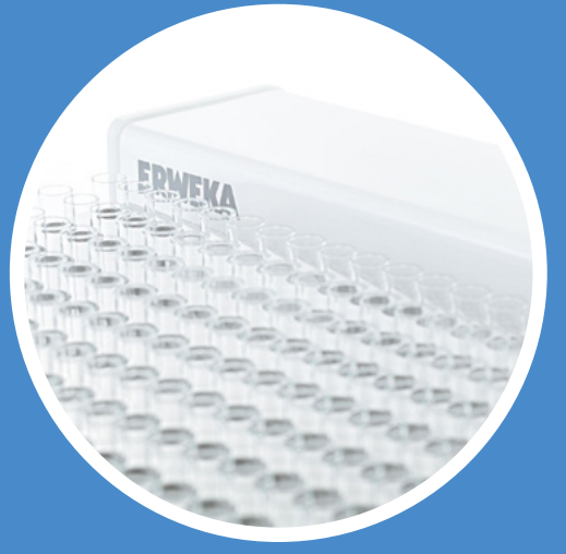
FRL sample sollector for DT Offline System with Disso.NET