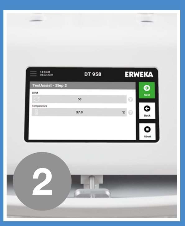
Step 2: Configure RPM and Temperature parameters of your dissolution run.