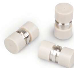
Trident HPLC Guard Cartridge