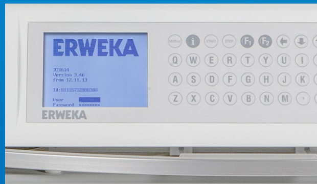
The DT 1610 Series comes with built-in intelligence for full system control