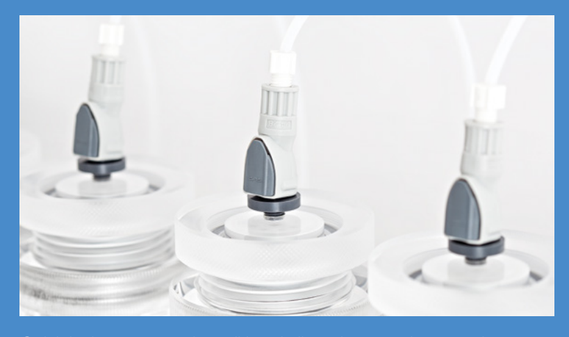
Quick lock system on the cell head allows instant tube removing.

The standardized cell head fits all offered cell bodies and facilitates along with the new standardized flat seals (only 3 pieces per cell: connection, head and body) handling and assembly of the cells. The optimized cell bodies with decreased cell wall thickness guarantee an improved cell heating.